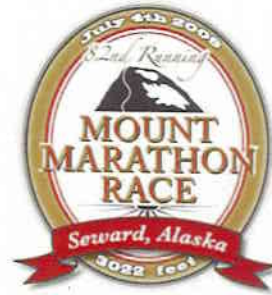
Race Logo Designed By Robert Flood